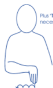
To Plant (plants / trees etc)