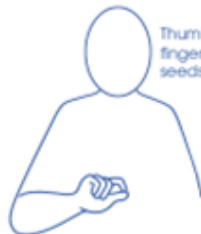
To Plant (bulbs / seeds etc)