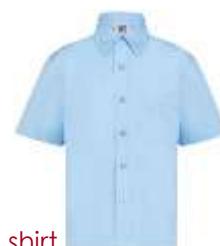
Light blue shirt (Short-sleeved avoids awkward cuff buttons)