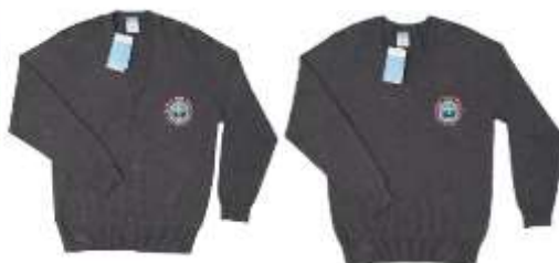
Dark grey cardigan or jumper