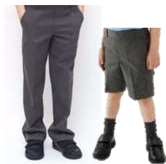
Dark grey trousers, mid-length shorts, pinafore dress or skirt (To be worn with dark grey socks or tights)