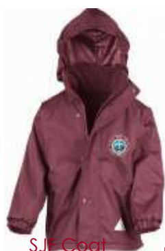
SJF Coat (Optional)