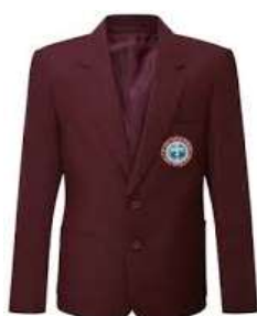
SJF Blazer (Optional)

Parents and carers can also purchase uniform items in the correct colours without a logo from other sources. Please note that our official suppliers are the only organisations permitted to sell SJF uniform with a logo.