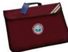
SJF Book Bag (for younger children, stores more easily than a rucksack)