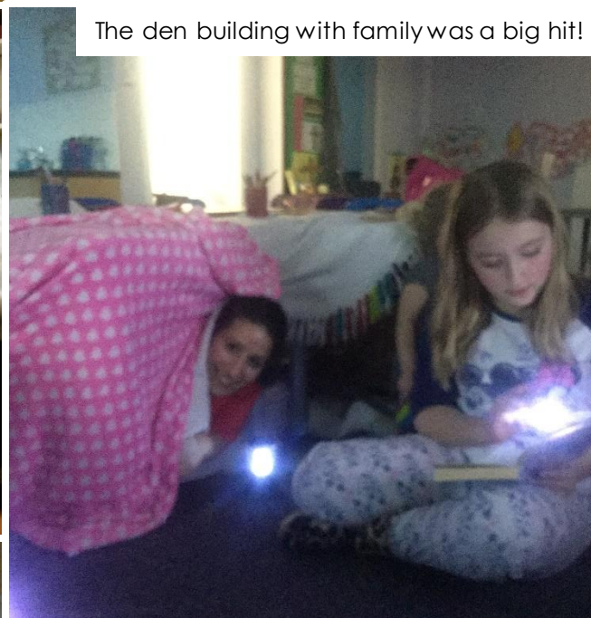
The den building with family was a big hit!