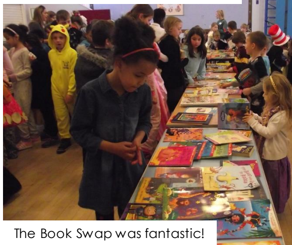
The Book Swap was fantastic!