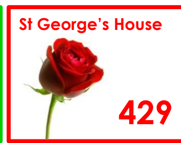
Please make sure that all the smileys are handed in so that they can be counted.